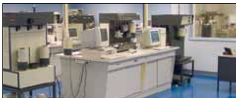
Quantachrome Instruments Application Laboratory.

Quantachrome is also recognized as an excellent resource for authoritative analysis of your samples in our fully equipped, state-of-the-art powder characterization laboratory.