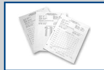
Built-in printer port for reporting options